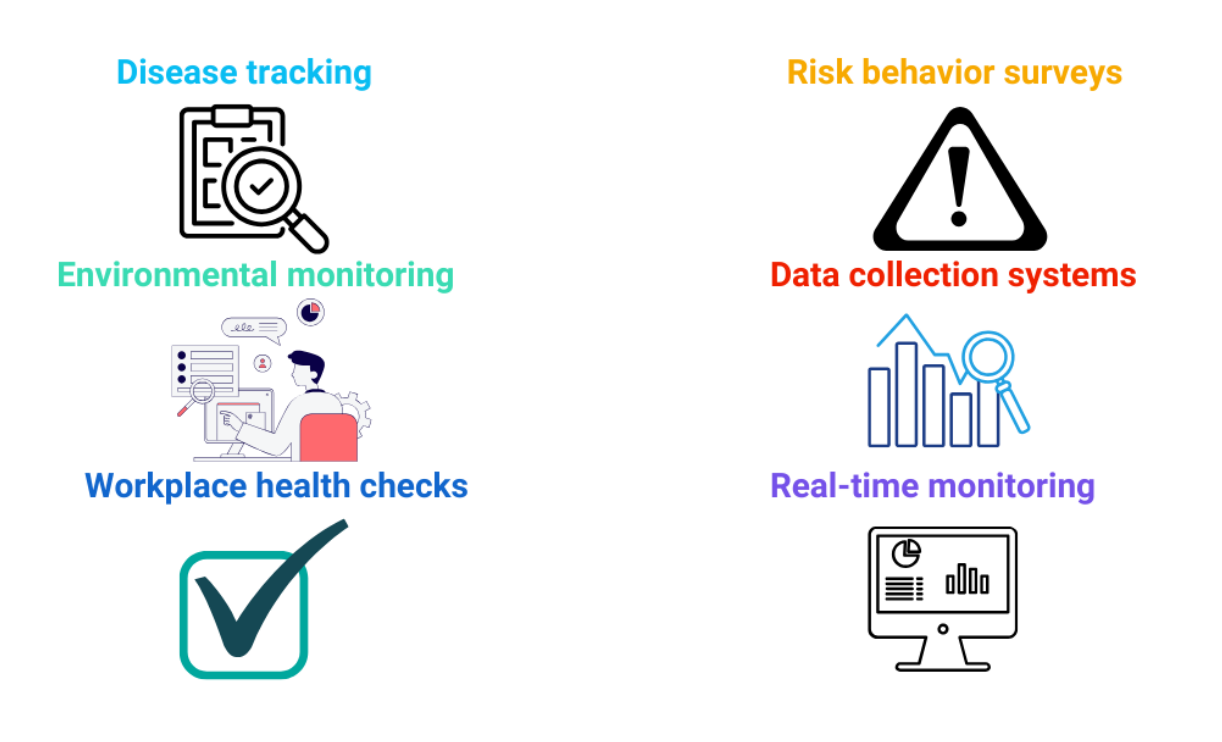
Figure: 2 showing health surveillance for public sector

Disease monitoring consists of continuous observation of particular health conditions and diseases as they develop over time. Real-time monitoring is available for urgent situations though some disease surveillance needs periodic checks established by the nature of the observed disease. The surveillance systems concentrate on infectious diseases throughout their operations to track infections like tuberculosis and influenza alongside non-communicable diseases (NCDs) including diabetes cancer as well as cardiovascular problems [18]. Public health surveillance employs different frameworks that direct process activities from data acquisition through information analysis into appropriate action responses. The public health surveillance system defined by Centers for Disease Control and